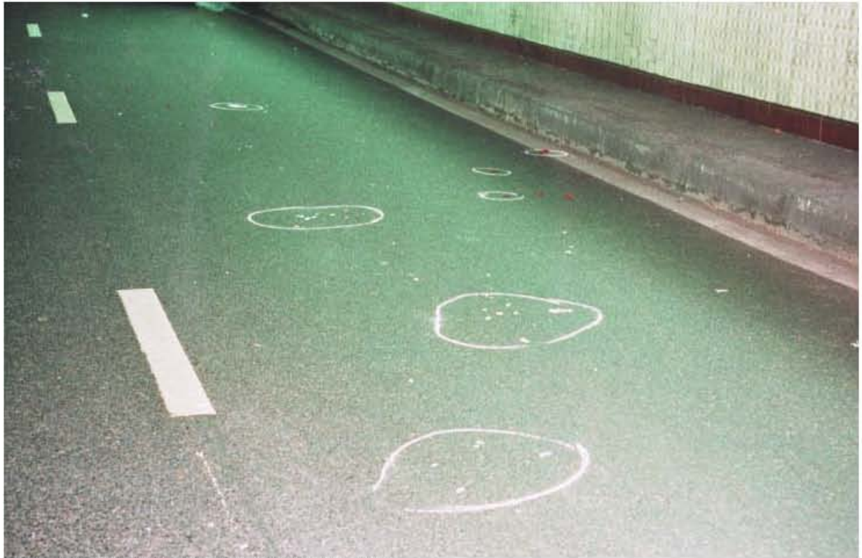
Figure 5 Debris marked awaiting collection.